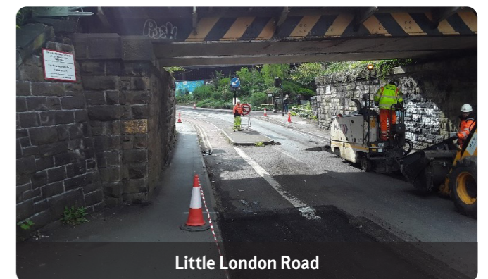
Little London Road

Following this we resurfaced Hallowmoor Road in the north of the city, before moving onto Little London Road, resurfacing from the junction with Chesterfield Road, underneath the railway bridge, up to Broadfield Way. Network Rail were on-site to ensure that we worked safely in and around the bridge, all of which went very smoothly, and the work was completed on schedule.