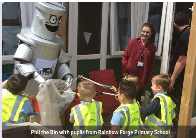
Phil the Bin with pupils from Rainbow Forge Primary School

Our Education Officer has delivered litter assemblies to almost 4000 school pupils in Sheffield during the past academic year. Even Phil the Bin, the Streets Ahead litter mascot, got in on the act, visiting schools to help the pupils understand the harmful impact of litter on the environment.