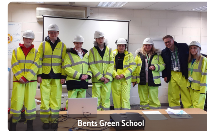
Bents Green School

From tours of the Olive Grove depot to learning all about the different jobs our employees do, and of course, meeting Phil the Bin, the pupils were kept busy and entertained throughout! We loved having them and look forward to seeing them again soon.