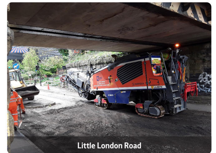
Little London Road

Following this we resurfaced Hallowmoor Road in the north of the city, before moving onto Little London Road, resurfacing from the junction with Chesterfield Road, underneath the railway bridge, up to Broadfield Way. Network Rail were on-site to ensure that we worked safely in and around the bridge, all of which went very smoothly, and the work was completed on schedule.