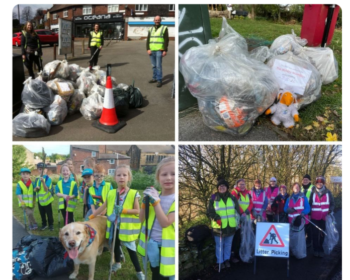
Just some of our local litter picking heroes!

If you want to get involved, take a look at the information on our website about how you can go about this safely, the equipment you can request and how to report your litter picks to us: www.sheffield.gov.uk/home/pollution-nuisance/organise-litter-picks.html