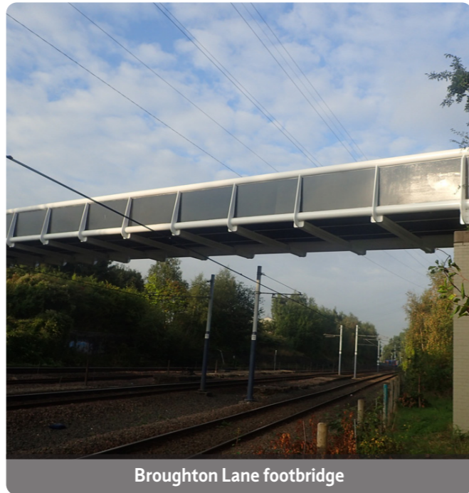
Broughton Lane footbridge

Pages 17 We complete the works on Broughton Lane Bridge we worked with both Network Rail and Supertram to coordinate track usage which ensured the safety of workers and the users of the railway and Supertram.