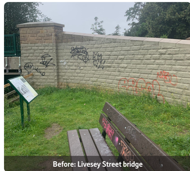
Before: Livesey Street bridge